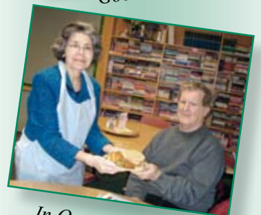
In Our Community Dining Rooms