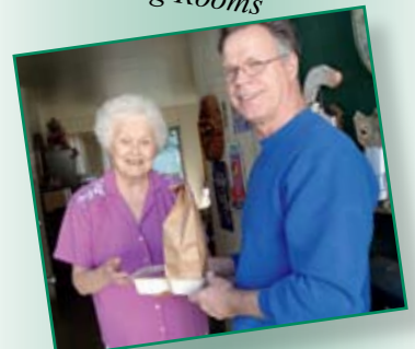
Or Your Home